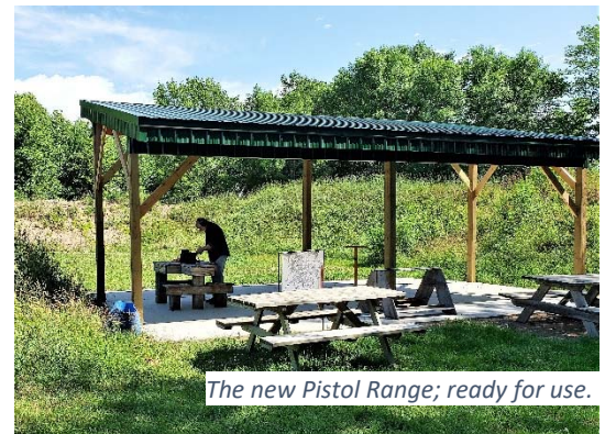
The new Pistol Range; ready for use.

He has done a great job for the gun club over his years as President. He can motivate others with ease. I know he will keep coming to the club and volunteering when he can. On behalf of the club, I want to wish him well as he spends a little more time with family and things on his 'other' list. Thank you!